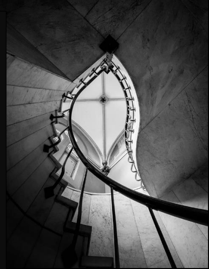
Photo Interests- Architecture, Fine Art

Activity level- indoor, outdoor, walking